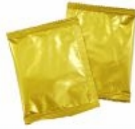
Sachet filling for powdered products