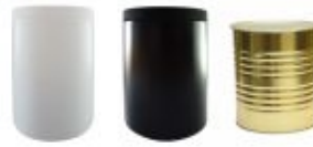
Container filling of powdered products

We are also able to offer the following services through SKLEW Alliance Production Lines