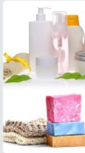
Personal care Skincare