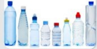
PET bottling for liquid drinks