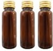
Glass bottling for liquid products

We can package your finished product in the following form in our GMP certified facility.